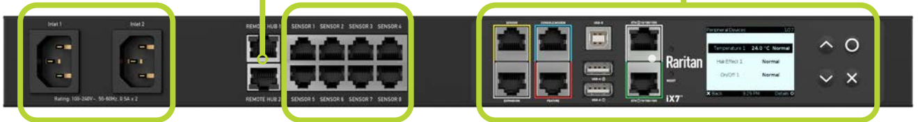
Model Shown: SRC-0800

The iX7 controller provides a future-proof design, with more computing power, higher efficiency processors, a host of extra ports, and standard Gigabit Ethernet.