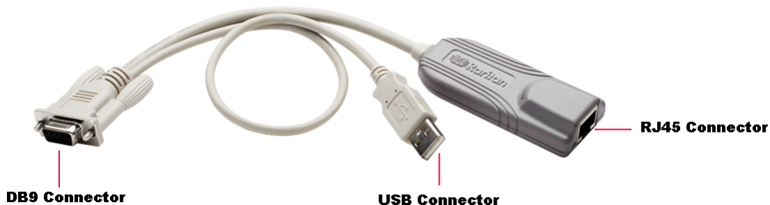
Figure 2 P2CIM-SER/P2CIM-SER-EU Connectors

Note: If the ASCII device consists of an RJ45 connection for console management, you may connect the P2CIM-SER or P2CIM-SER-EU by utilizing the following Raritan components: