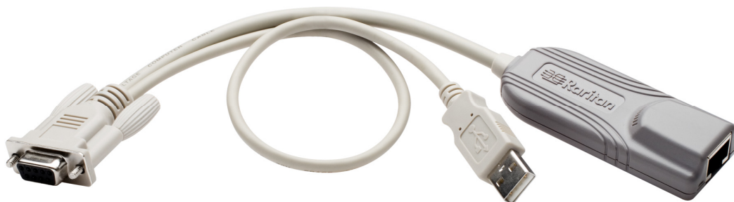
Figure 1 P2CIM-SER/P2CIM-SER-EU