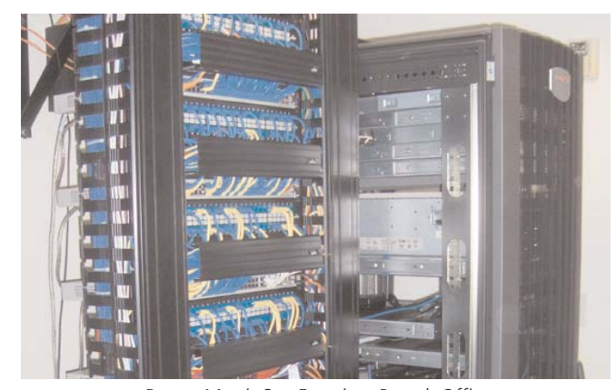
Duane Morris San Francisco Branch Office

Up to 16 servers connect to each Dominion KX216 switch. In turn, all the Dominion KX switches can be controlled through Raritan's CommandCenter Secure Gateway, which provides user-defined, logical views of the entire enterprise, as well as BIOS-level access to all servers via a Web browser. Through a single sign-on to a single IP-address, CommandCenter Secure Gateway provides real-time views of an enterprise – physical and virtual servers – on one screen.