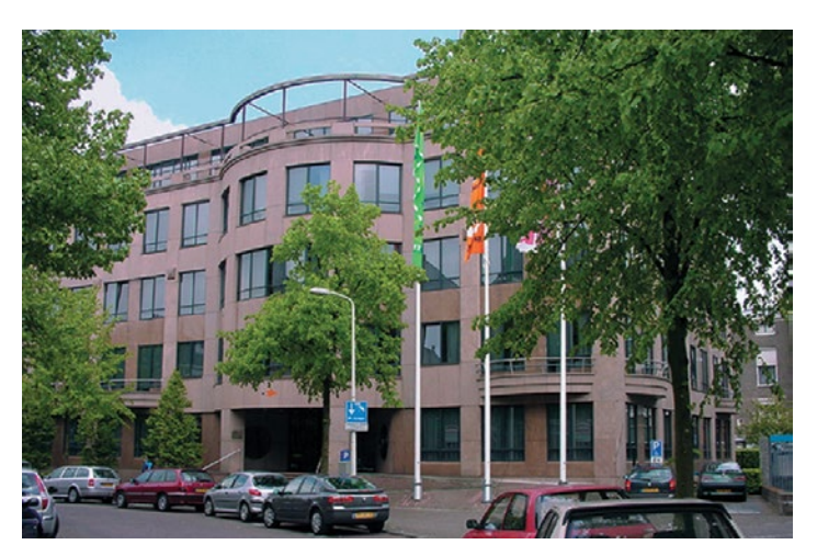
Dutch National Lottery headquarters, The Hague