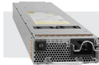
Figure 1 Cisco Nexus 7700 3.0-kW AC Power Supply Module

The smaller power supply configuration provides more flexibility and greater control in power provisioning. The 8 power supply bays are designed for future growth, and most common configurations do not require the use of all power supply units for redundant power configurations.