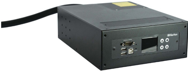
Raritan Enclosure Kit, Including Main and Branch Metering Modules with the controller

With its exclusive hardware architecture, Raritan's BCM leverages the latest controller technology the new iX7™ controller on both BCM2 in-house enclosures and modular controllers.