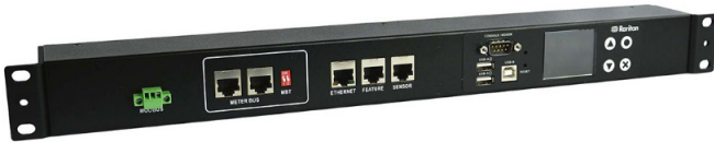
Raritan Enclosure Kit, Including Main and Branch Metering Modules with the controller

Raritan's BCM Controller features a host of control ports with dual USB, color screen, dual networking and standard Gigabit Ethernet. The controller itself is hot swappable in the unlikely event of a failure. Each power meter controller can handle up to 8 main and branch circuit metering modules, or cascade up to 70 main metering modules, with standard Cat5 cable.