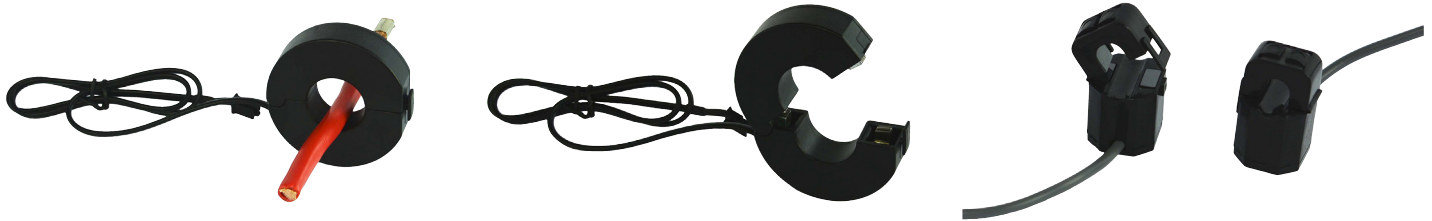
Split Core CTs, 60 Amps to 400 Amps

Why should processing facilities care about detailed insight into their power infrastructure? Intensive production and industrial facilities rely heavily on all the data they get out of BCM solutions in order to make efficient power management decisions. This ensures higher uptime, impacting run rates and overall profitability.